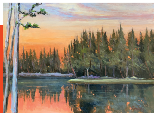
PATRICIA WALLIS BITS AND PIECES OF THE SILVER STATE MAY 20 - JUNE 7, 2019