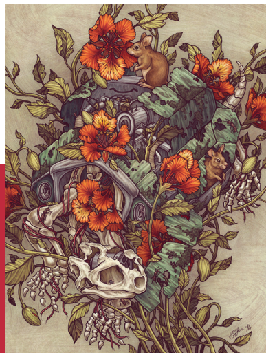
KATE O'HARA BOTANICA OBSCURA FEBRUARY 25 - MARCH 15, 2019