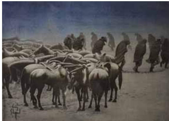
■ "Subzero Cold Makes Running in Circles Necessary" Black Rock Desert, 1975 Watercolor 1975

University Galleries, University of Nevada, Reno