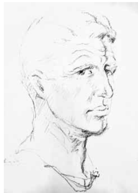
Untitled (Self Portrait) Pencil Not dated

Library Special Collections, University of Nevada, Reno