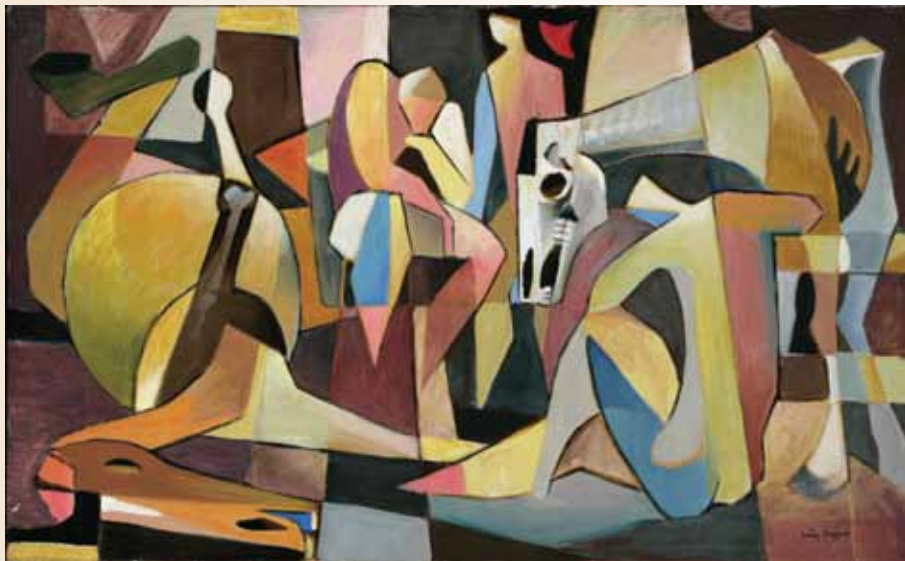
■ Untitled , from “ The Dead Horse ” series Oil on canvas 1959