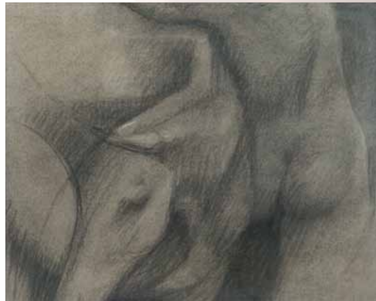
■ Male Nude and Horse Charcoal Not dated