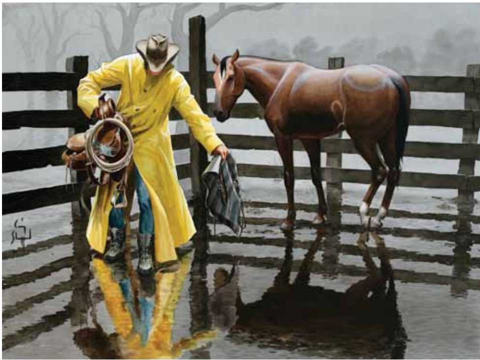
November Rain Watercolor with acrylic varnish on board 1973