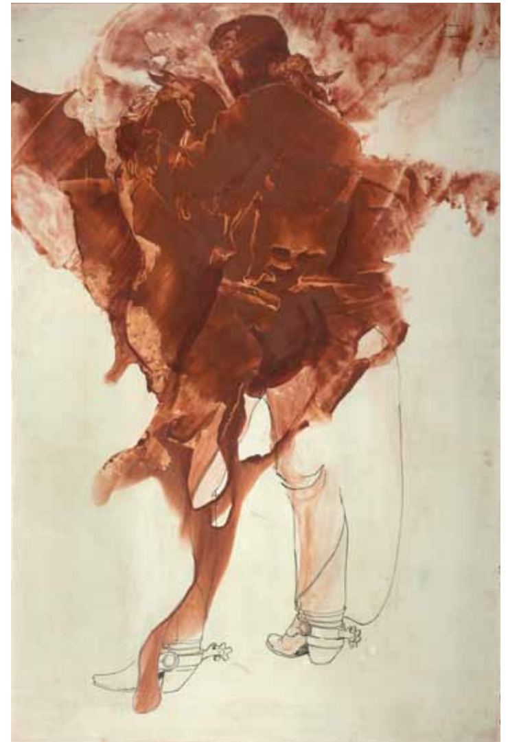
■ Untitled , ( Cowboy with Spurs ) Oil on board 1972

Nevada Museum of Art, Reno, Gift of Sophie Sheppard