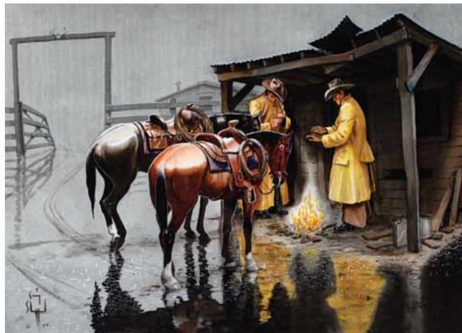
Warming Up Watercolor Not dated