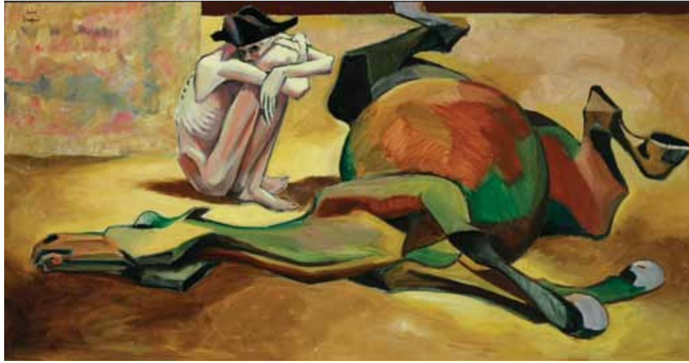
■ Strange Vigil Oil on canvas 1959

Nevada Museum of Art, Reno, Gift of Sophie Sheppard