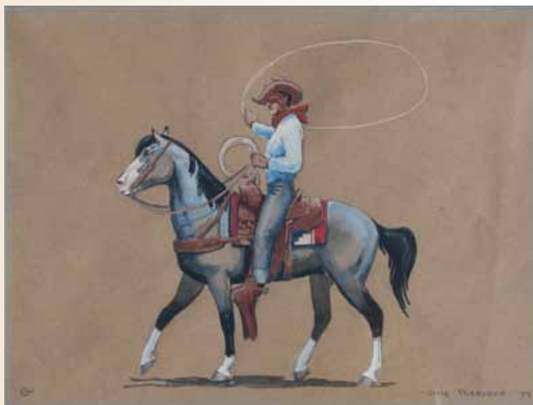
Horse and Rider Gouache 1937