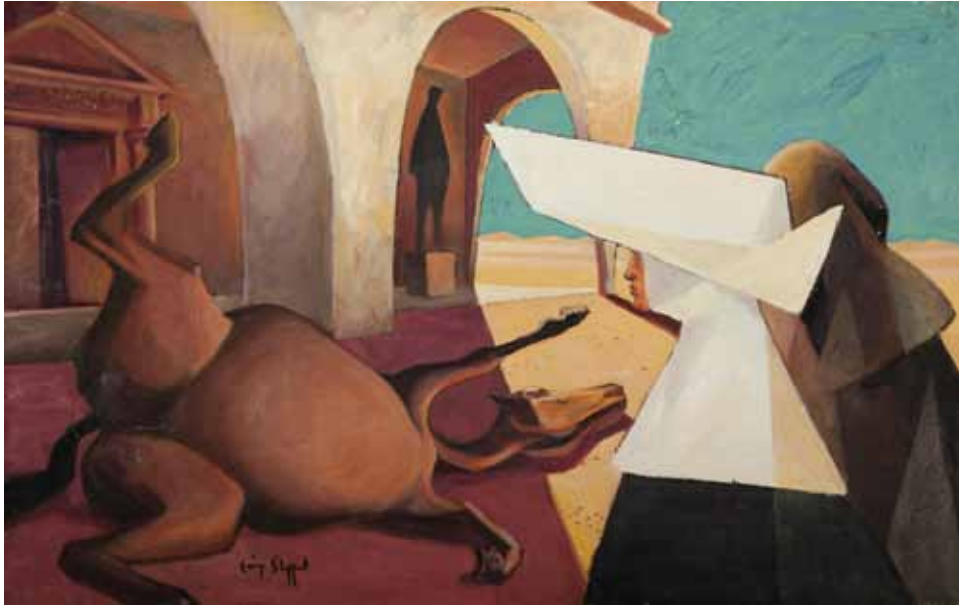
■ Untitled, from "The Dead Horse" series Oil on masonite Not dated

University Galleries, University of Nevada, Reno