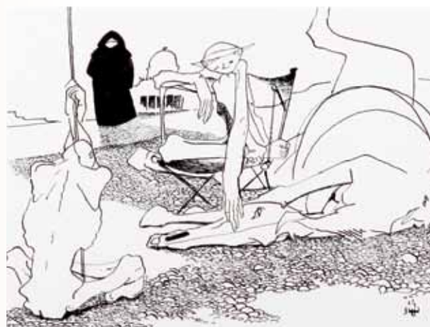
Untitled, from "The Dead Horse" series Pen and ink Not dated University Galleries, University of Nevada, Reno