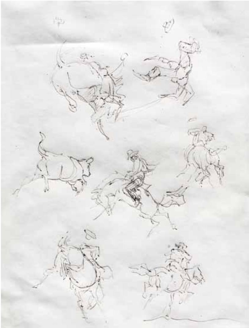
Study of Cowboys pencil circa 1962