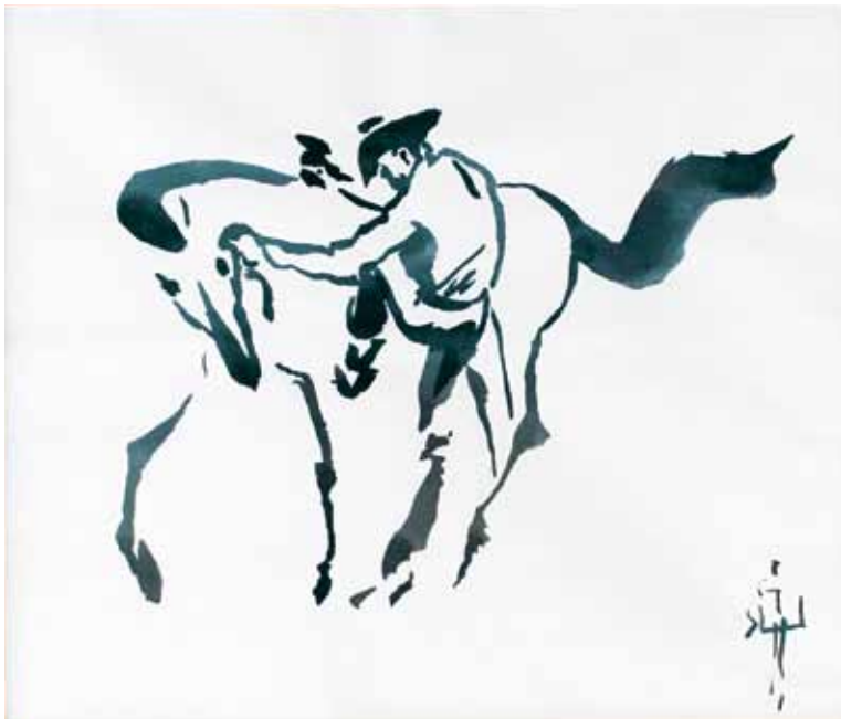
■ Rider Mounting Horse Sumi ink on paper circa 1962