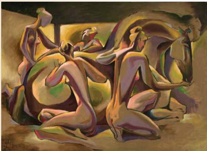
Luminous Reverence Oil on masonite Not dated