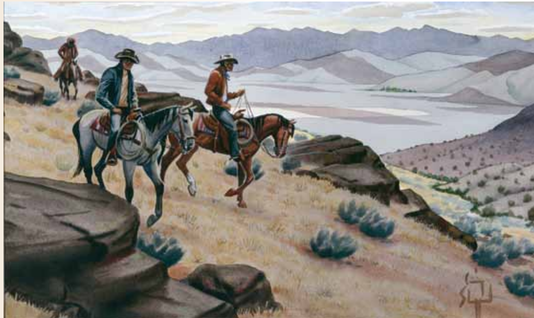
Silent Shadows Watercolor Not dated

Western Paintings and Drawings by Craig Sheppard