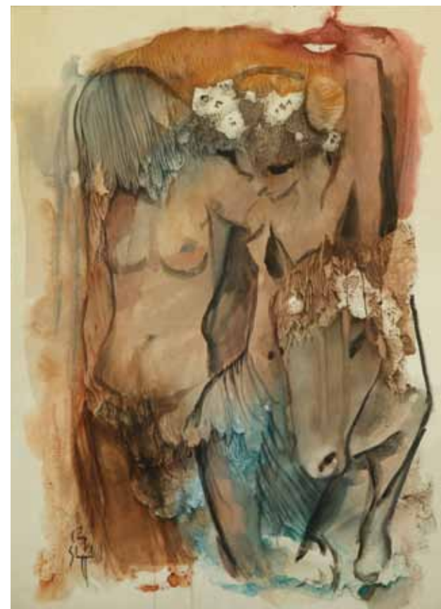
Journey French watercolor Early 60's University Galleries, University of Nevada, Reno